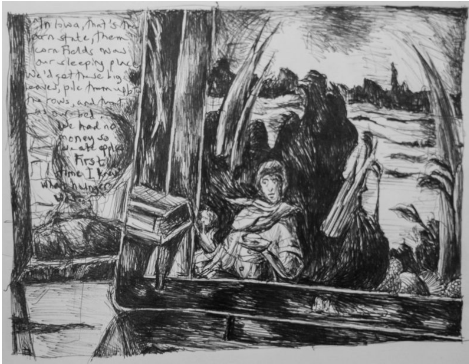
"corn fields was our sleeping place..." (Case No. 9, Wisconsin, Microcard Publications of Primary Records in Culture and Personality 1956).