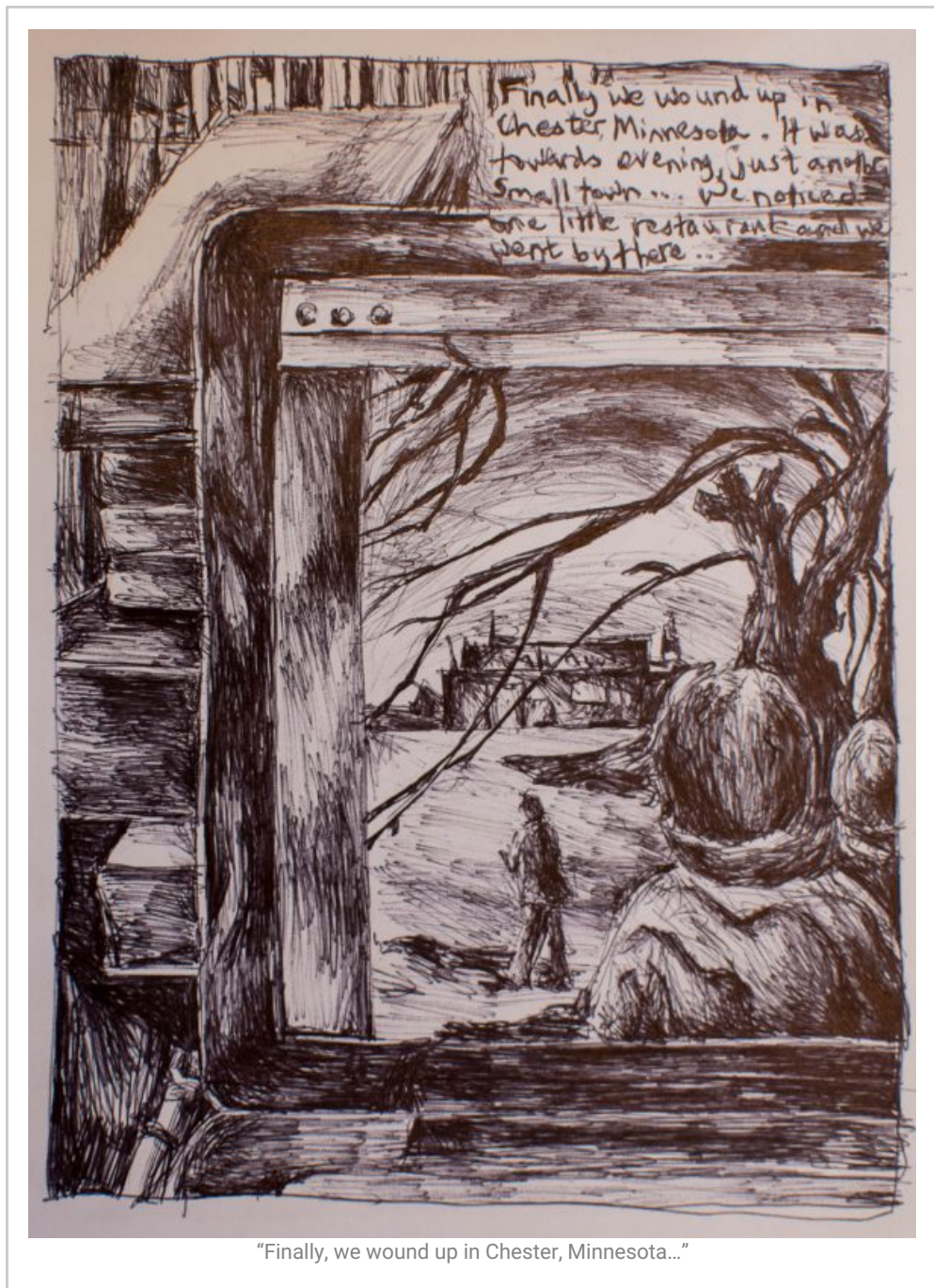
"Finally, we wound up in Chester, Minnesota..."